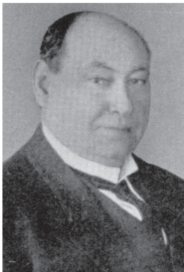
AOAC INTERNATIONAL Founding Member, Harvey W. Wiley