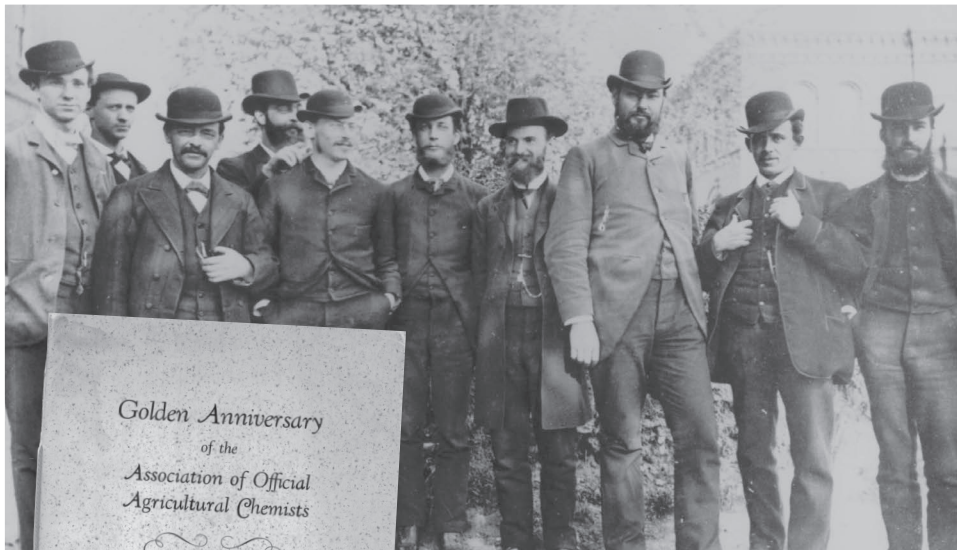
Harvey Wiley (third from right) and his staff, about 1883