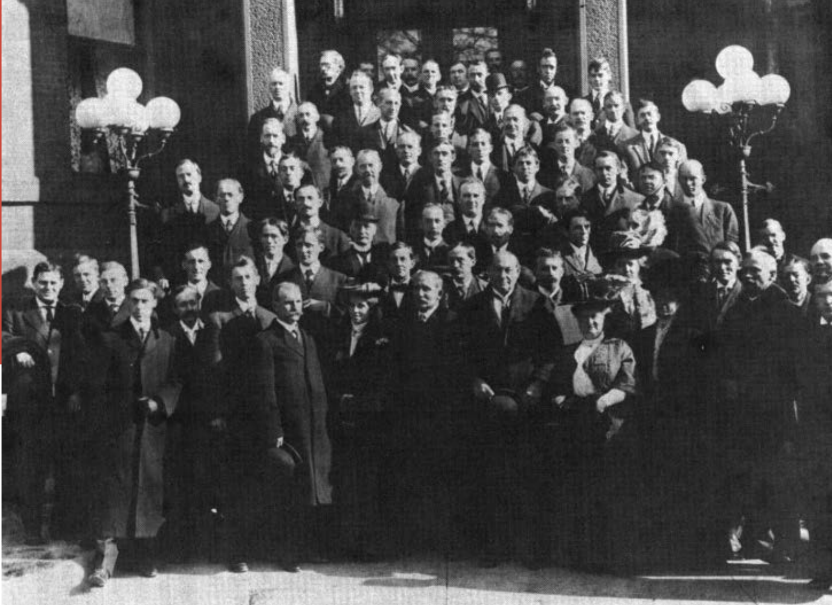
AOAC Meeting, Washington, DC, November 1908